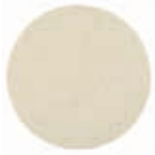
Polishing Felt Pad White, 2/Pack 125x6 mm Grip