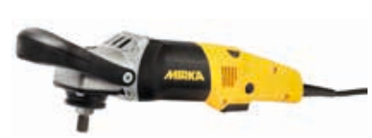
Mirka® PS 1437 Polisher 150 mm

A yellow soft micro fiber cloth, with a fine texture. Absorbs residue well and is washable.