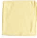
Cleaning Cloth 330x330 mm Yellow, 2/Pack

A flat hard 6 mm thick white felt pad, designed for glass polishing applications. The thick felt pad construction has a good balance and feels stable during polishing. The pad is designed to be used in combination with Polarshine E3 polishing compound and that combination provides a good glass sanding process.